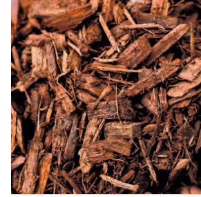
CHERRY BROWN MULCH