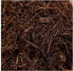
HARDWOOD BARK MULCH