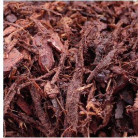
PINE BARK MULCH