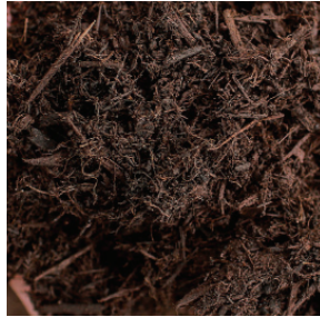
CHOCOLATE BARK MULCH